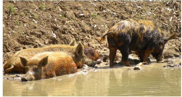
Feral pigs wallowing in a creek, Kimberley area, WA.

and will eat the eggs of ground-nesting birds, reptiles and amphibians and directly prey upon lambs, frogs and marine and freshwater turtles 2,3 .